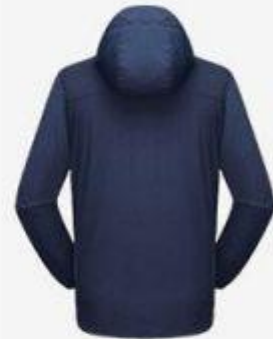
On the back