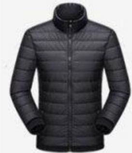
Thermal inner tank