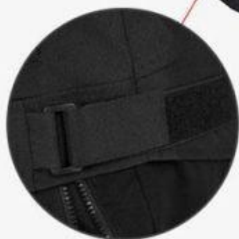
Adjustable band at hem