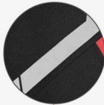
Night reflective strip