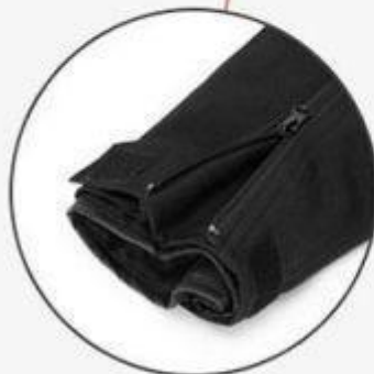
Cuff adjustment band