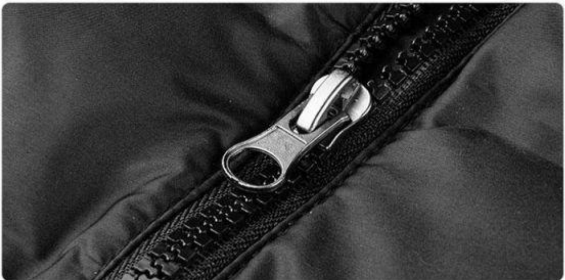
Durable zipper strip, easy to use