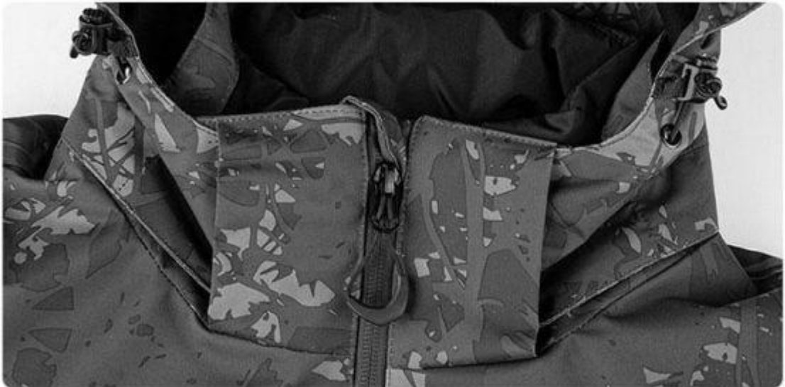
Windproof collar to block the cold