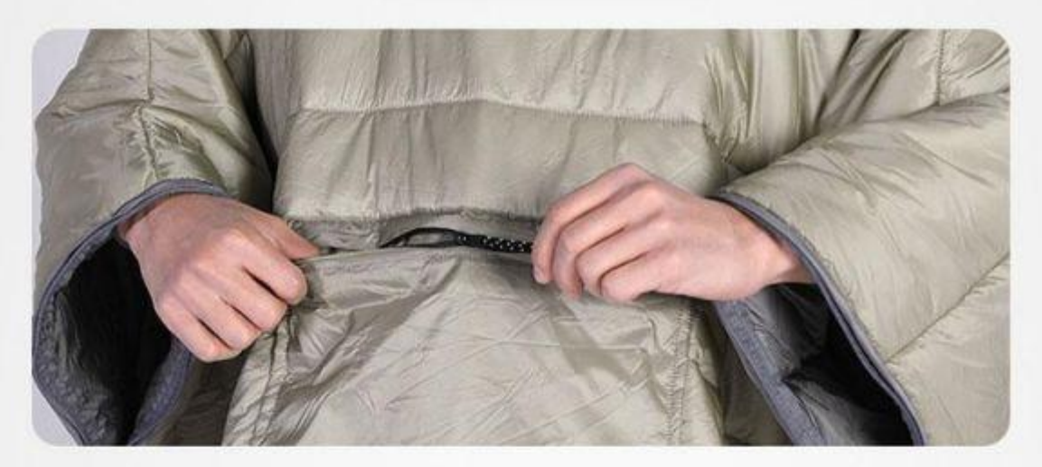
Zippered storage bag