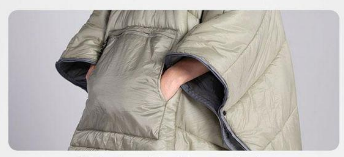
Side to side big pockets