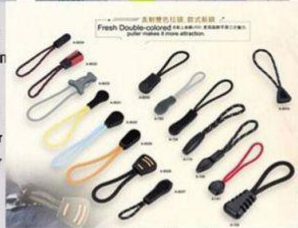
Snap Button & Logo Zipper Puller