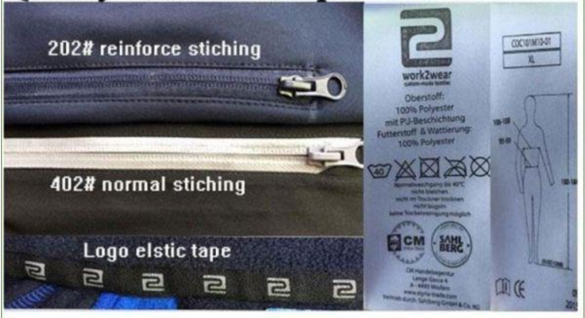
202# reinforce stitching