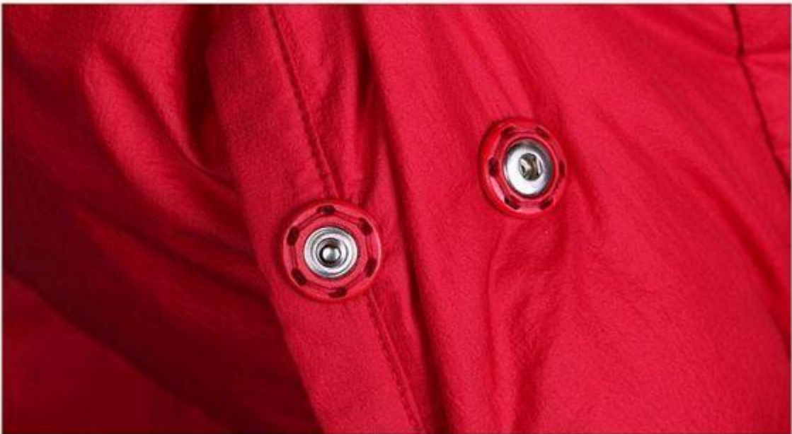
► Snap fastener design