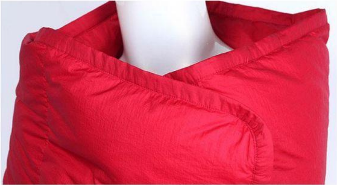
► Collarband design