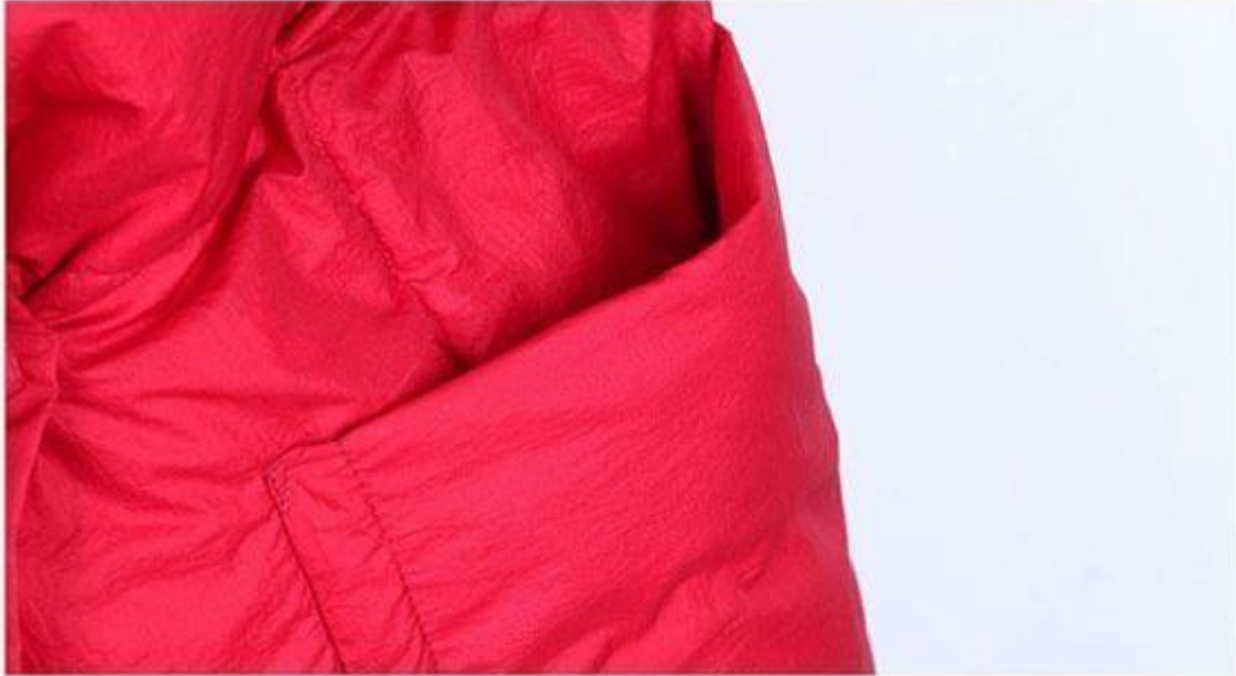
▶ Pocket design