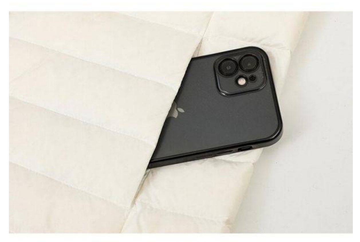
His pockets design Diagonal insertion pocket, convenient and practical