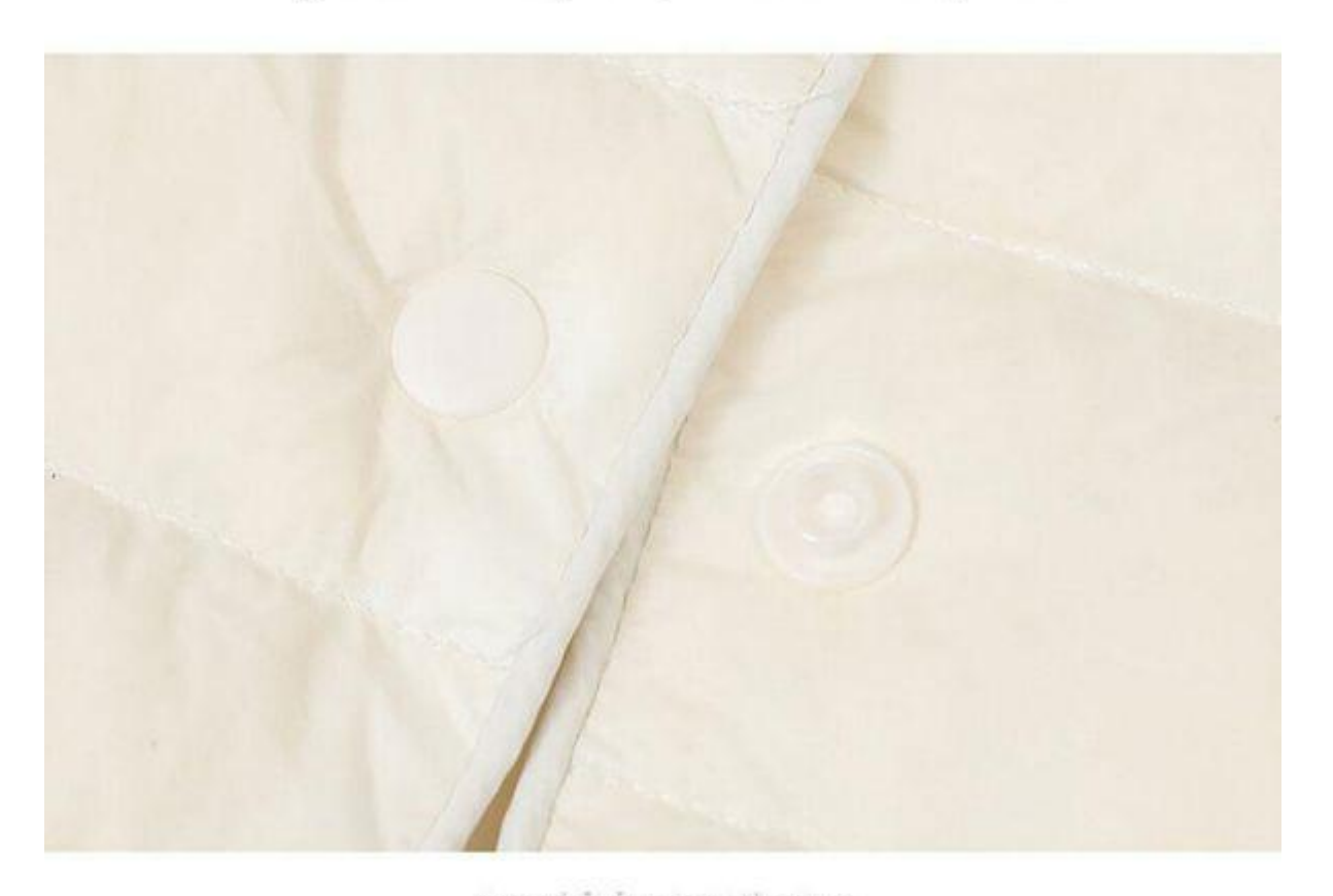
Snap fastener design Durable, not easy to fall off