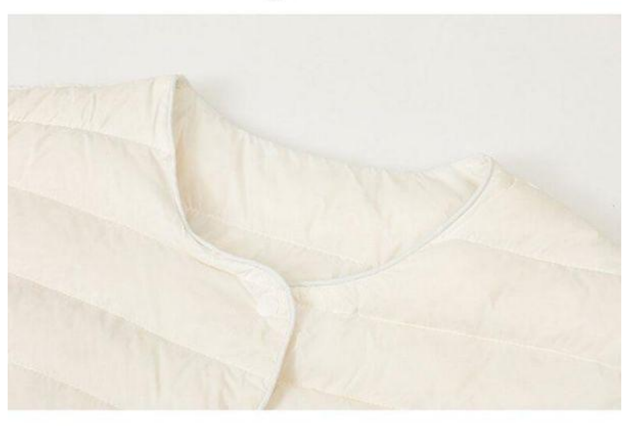
Collarband design Variable V-neck, white dot shape