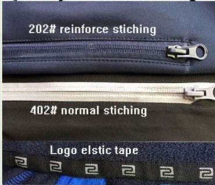
202# reinforce stitching