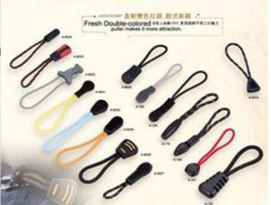
Snap Button & Logo Zipper Puller