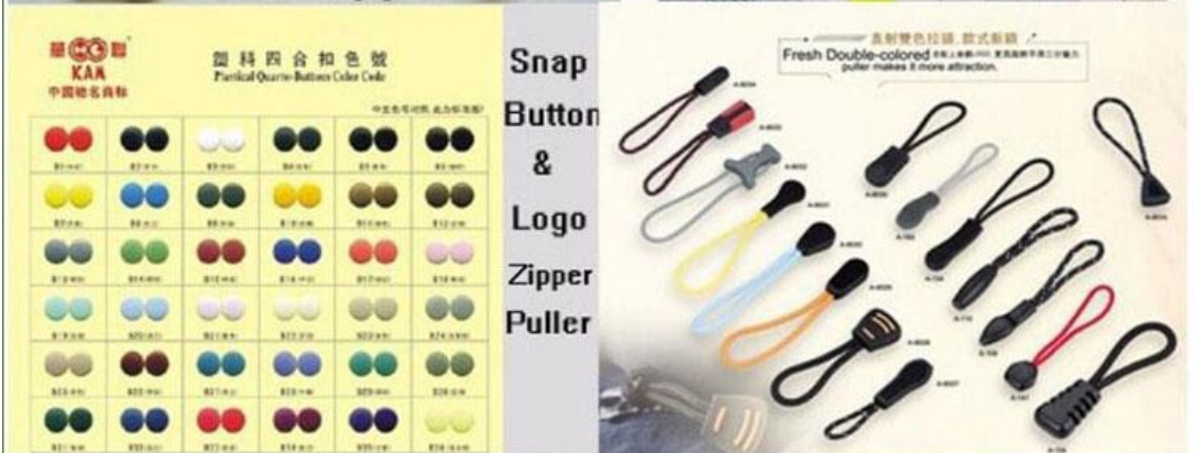
Snap Button & Logo Zipper Puller