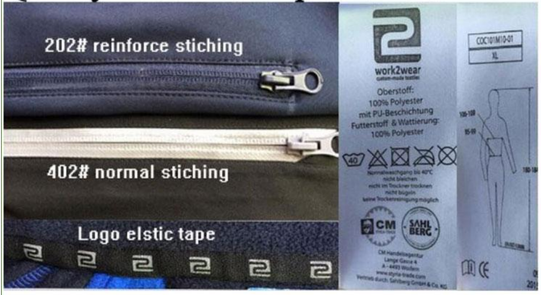
202# reinforce stitching