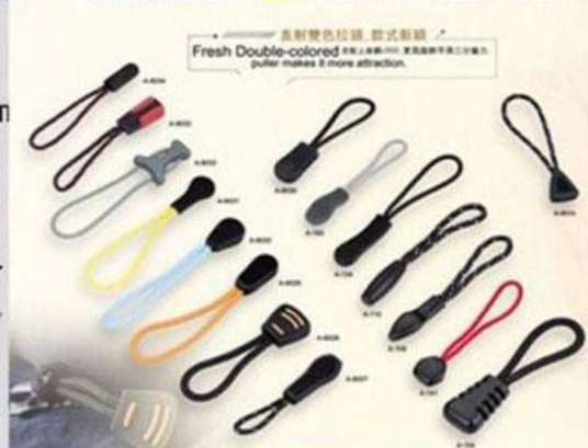
Snap Button & Logo Zipper Puller